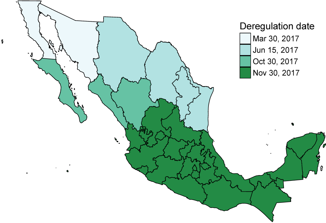
Figure 2: Gasoline and Diesel Price Deregulation Schedule